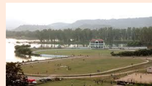
Cricket stadium, Luhnu Ground, Bilaspur