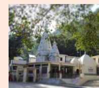
Rishi Markandeya temple

The institution is NAAC accredited and affiliated to the H.P. University vide notification 1/347/2007-HPU (Acad), and at present offers various undergraduate courses in the faculties of Science, Arts, and Commerce.