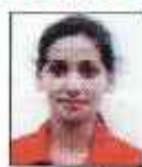
Avantika 449/500 (2020)