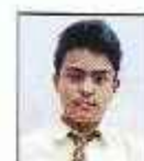
Nawang Tharchain Handball (National 2022)