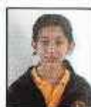
Diya 679/700 (2023)