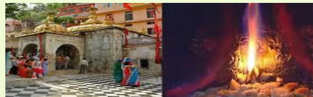
Maa Jwalamukhi Temple

Twin Heritage Villages: Garli-Paragpur founded in the late sixteenth century in memory of princess Prag Dei of the Jaswan royal family is the heritage village of Himachal Pradesh. It is famous for unique architecture heritage buildings, streets, mud plastered walls and slate roofed houses.